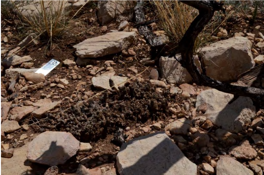
Figure 2. Center of monitoring plot (rectangular metal tag) behind a burned Lee's pincushion plant.