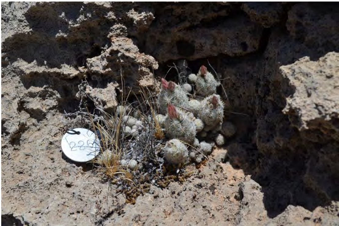
Figure 3. Tagged individual of Lee's pincushion cactus.