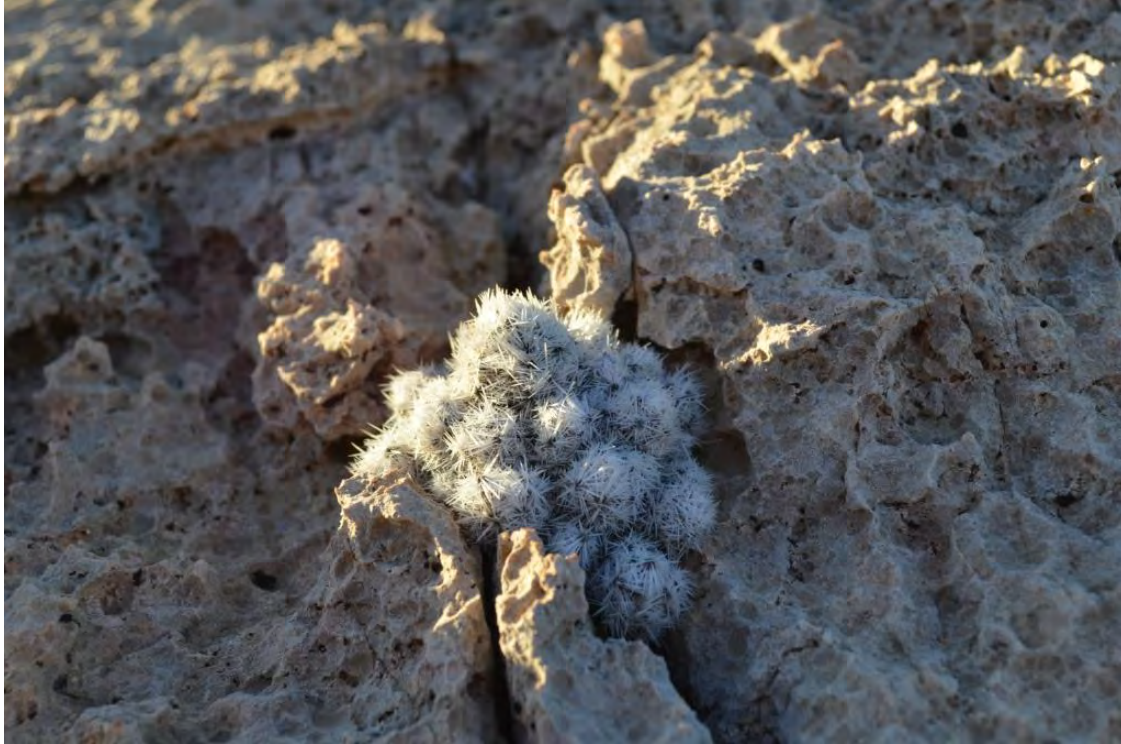
Figure 7. Dead Lee's pincushion cactus plant in the unburned area.