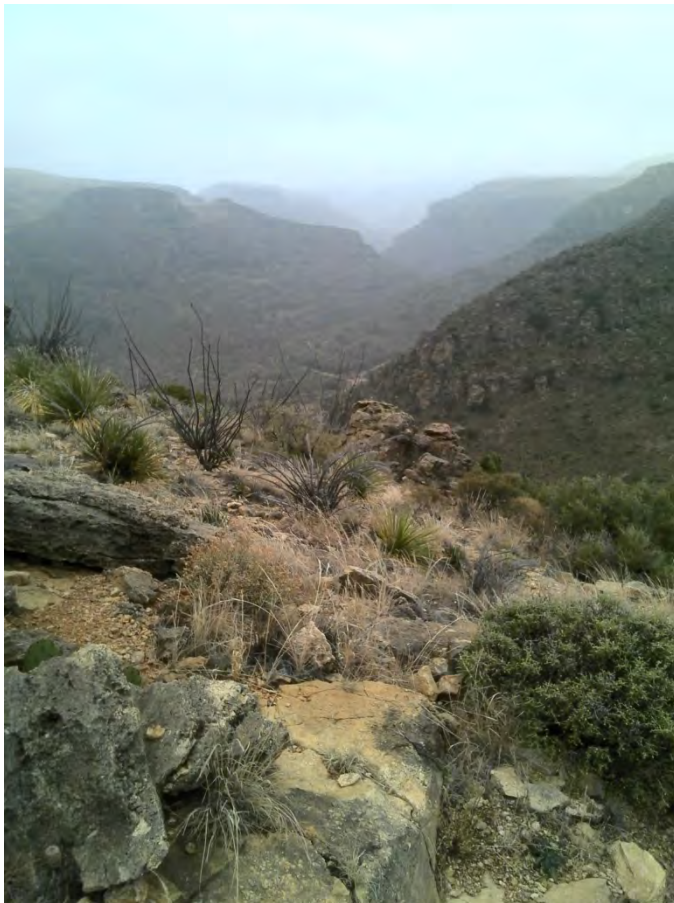
Figure 1. Habitat of Lee's pincushion cactus at Carlsbad Caverns National Park.

Lee's pincushion cactus ( Escobaria sneedii var. leei ) is endemic to New Mexico where it is restricted to the Carlsbad Caverns National Park area in the Guadalupe Mountains of Eddy County. It occurs primarily in cracks of limestone outcrops, in areas of broken terrain and steep slopes in Chihuahuan desert scrub communities between 4,000 and 5,000 ft in elevation (Figure 1).