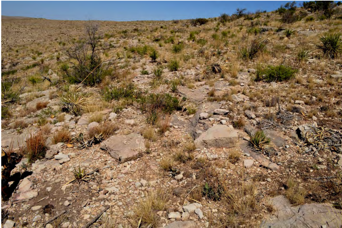
Figure 6. Recovering habitat of Lee's pincushion cactus, 3 years after the Loop Fire.

overall population trends, which will help guide appropriate management actions in response to future wildfires and inform proper planning for prescribed fires and other management activities. In addition, population monitoring and studying the impacts of fires on this federally listed species are key tasks that need to be accomplished for the recovery of Lee's pincushion cactus (USFWS 1986).