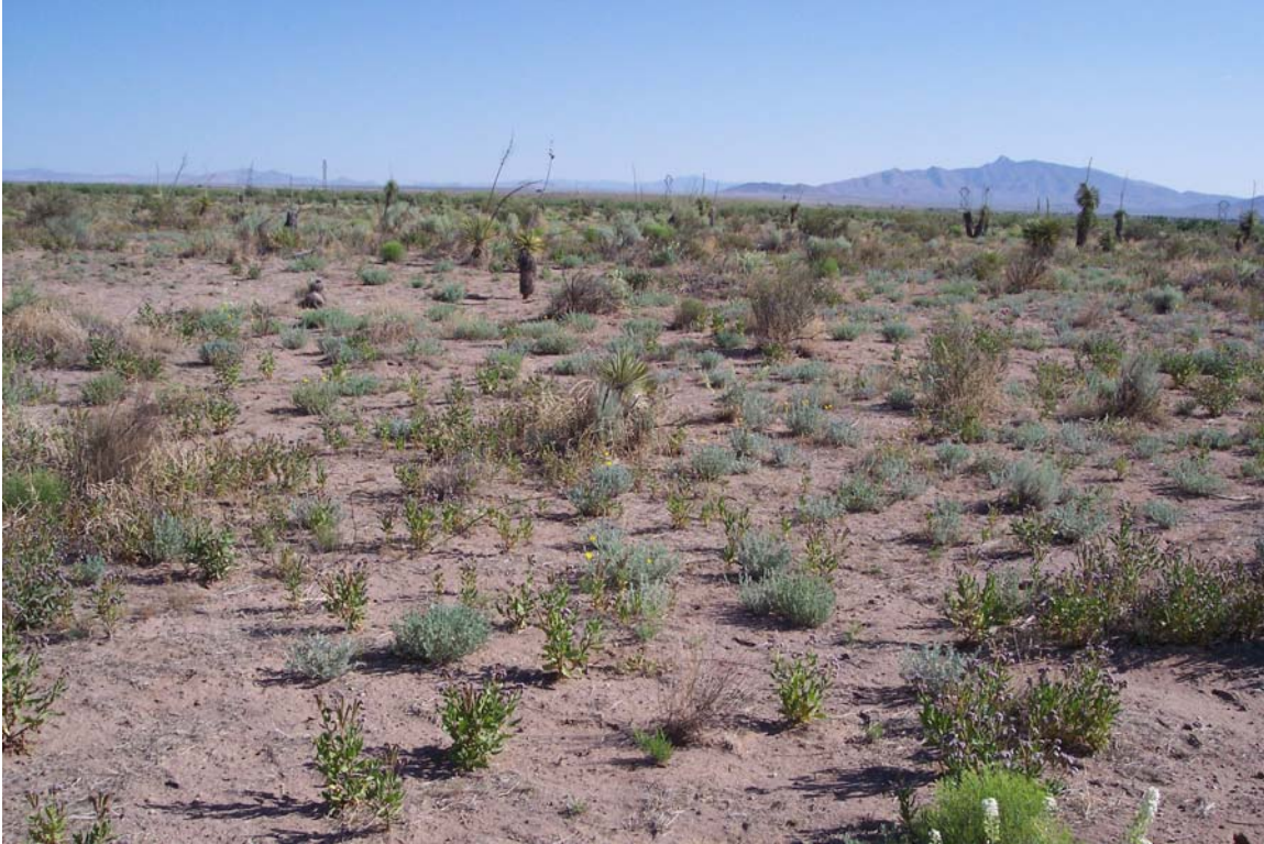
Figure 14. Habitat north of photo point 106.