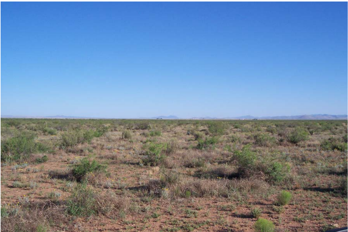
Figure 7. Habitat northwest of photo point 108.