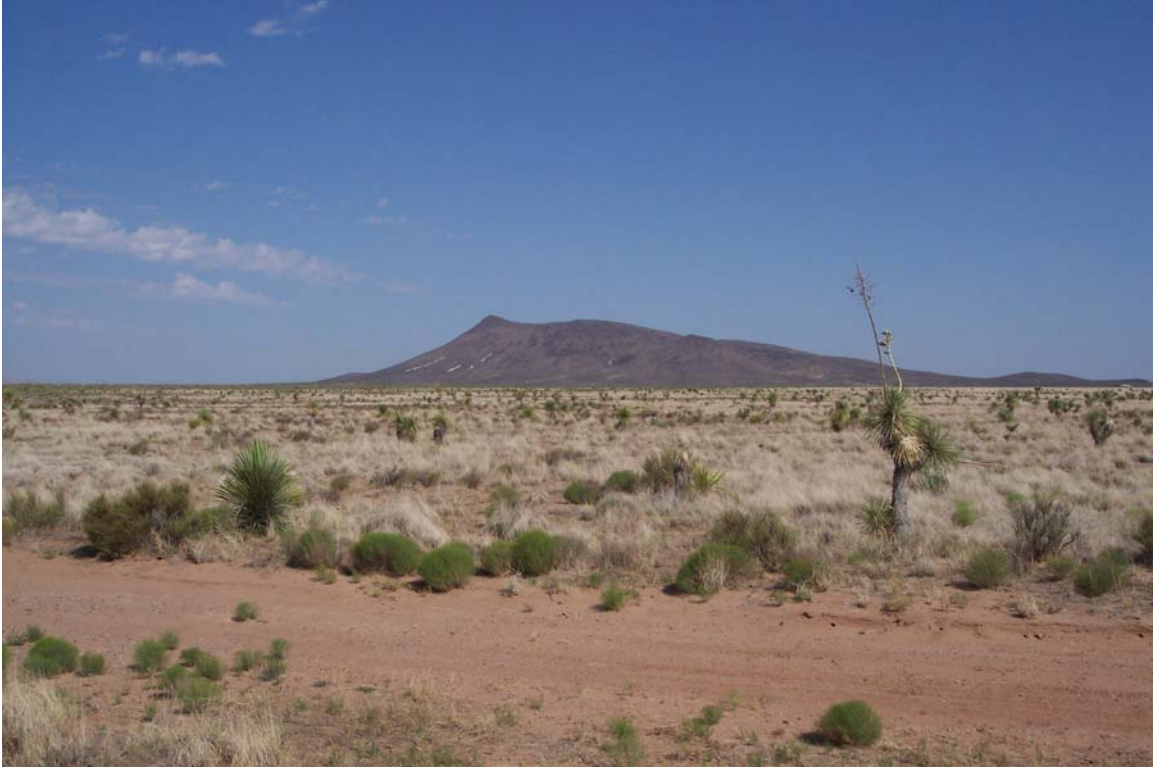
Figure 10. Habitat northwest of photo point 3.