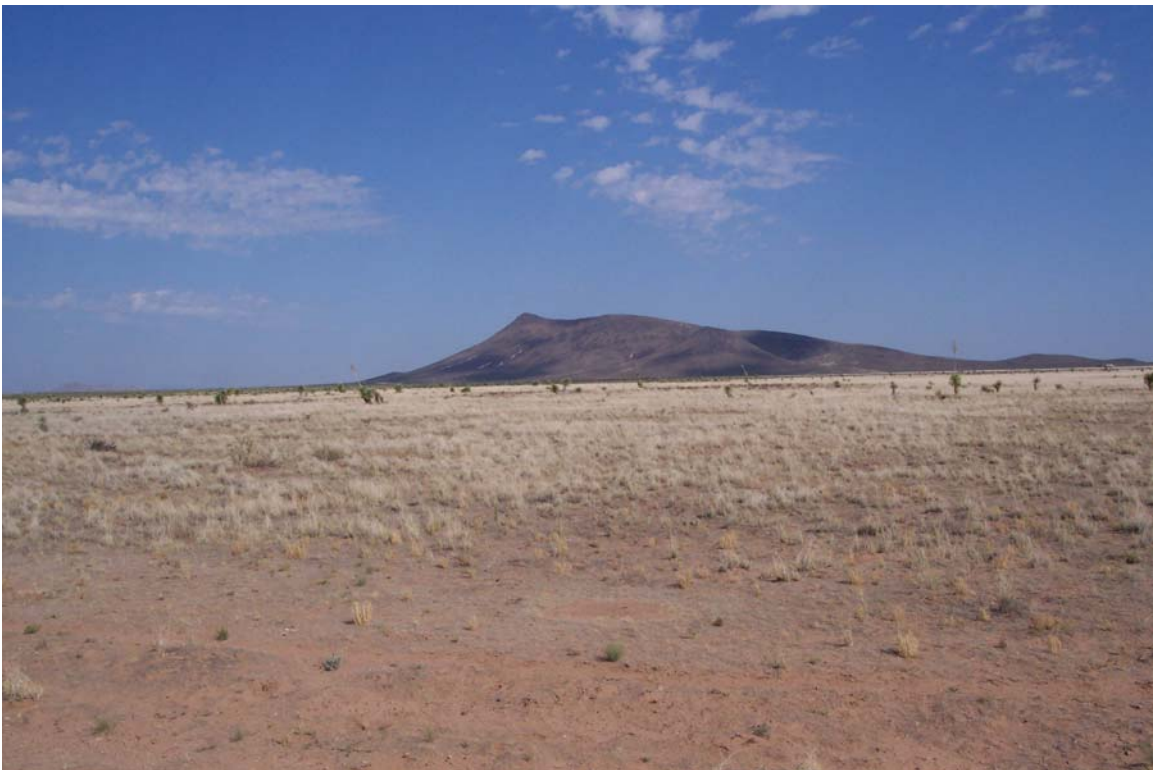
Figure 9. Habitat northwest of photo point 2.