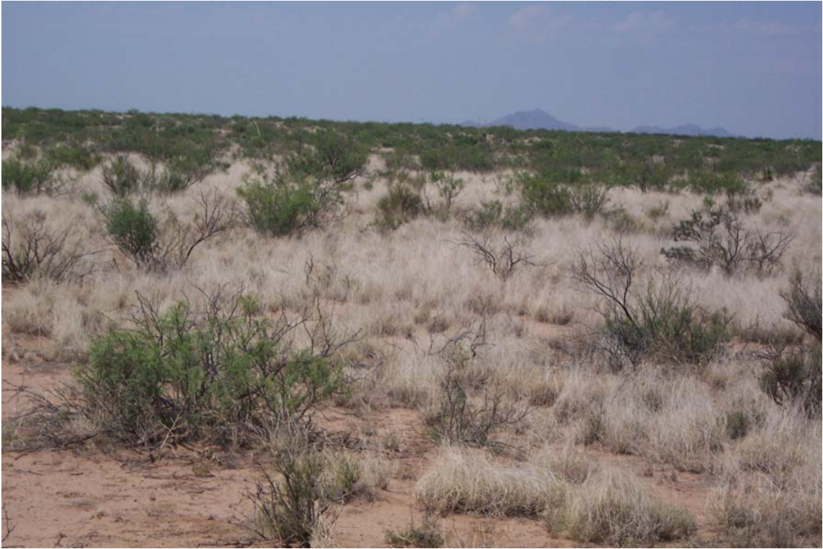
Figure 12. Habitat south of photo point 12.