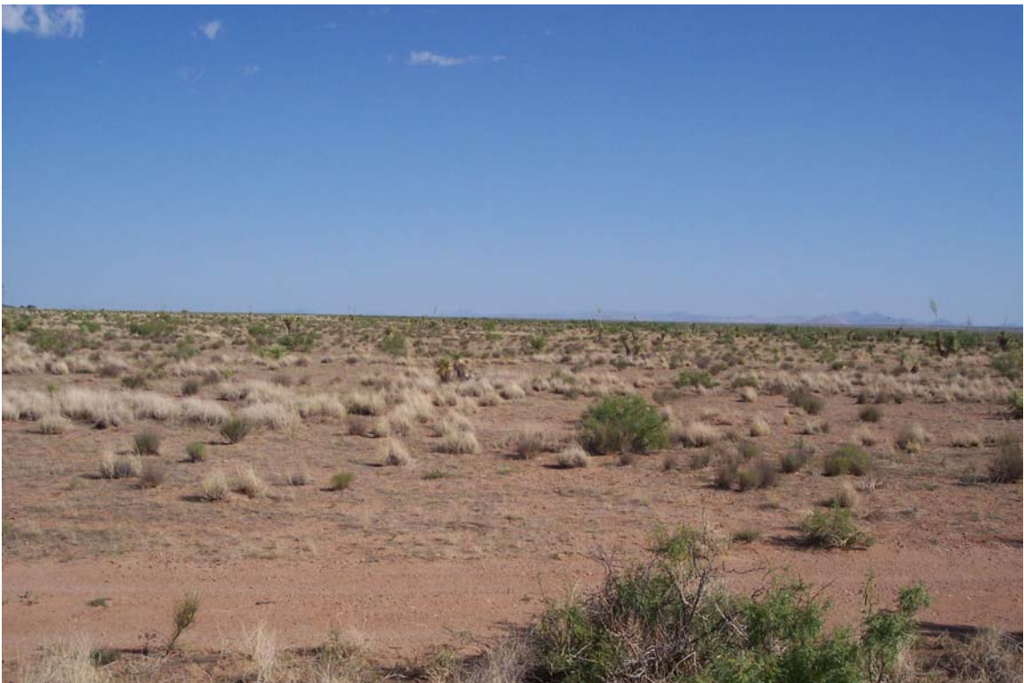
Figure 11. Habitat north of photo point 16.