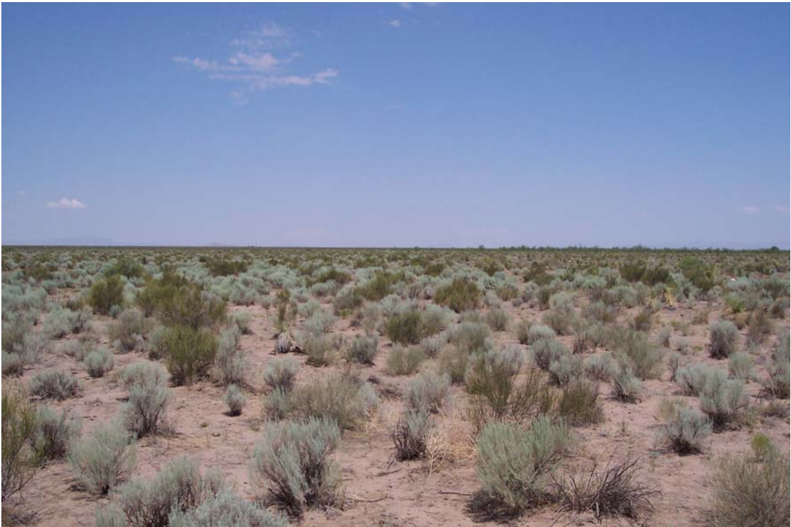
Figure 13. Habitat north of photo point 14.