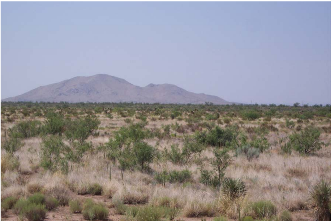
Figure 5. Habitat south of photo point 9.