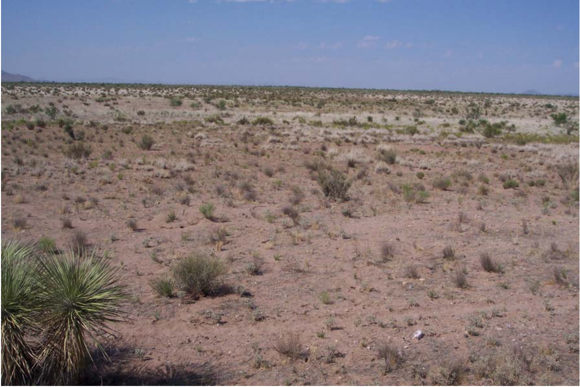
Figure 4. Habitat southwest of photo point 5.