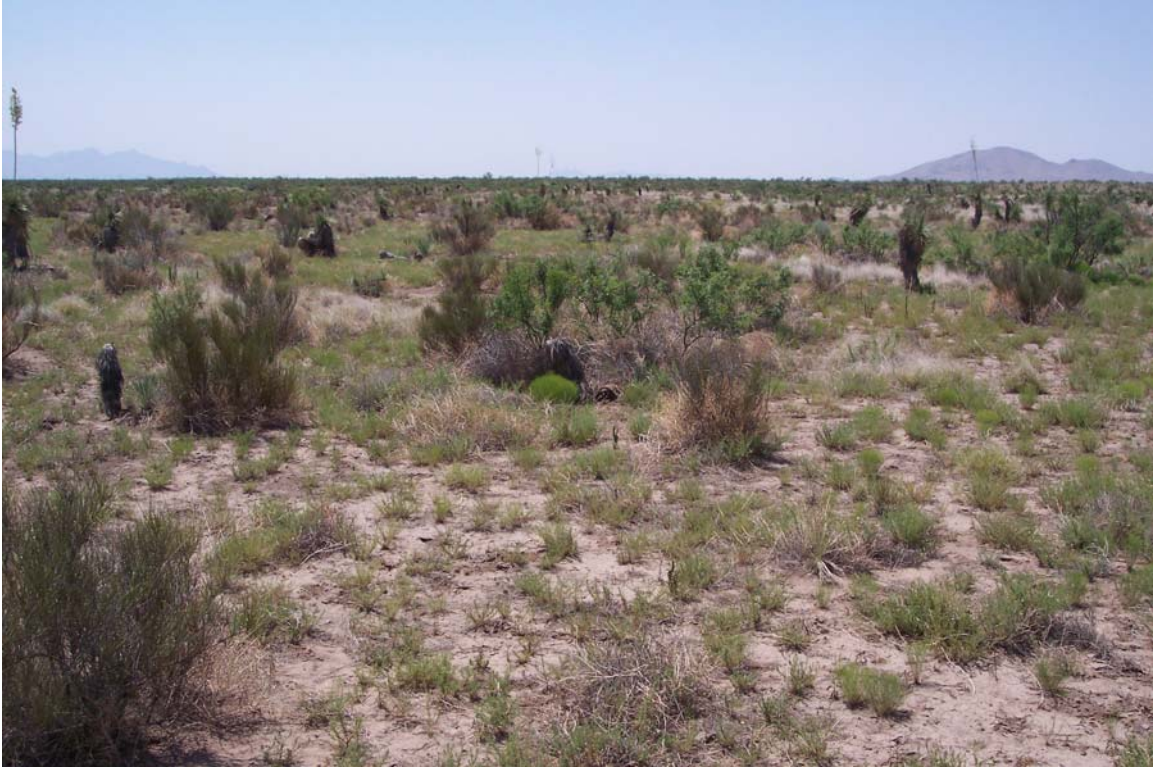
Figure 6. Habitat south of photo point 13.