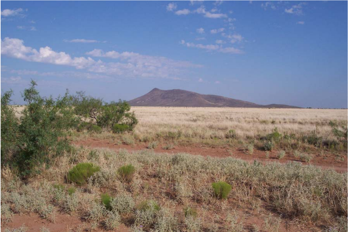
Figure 8. Habitat northwest of photo point 1.