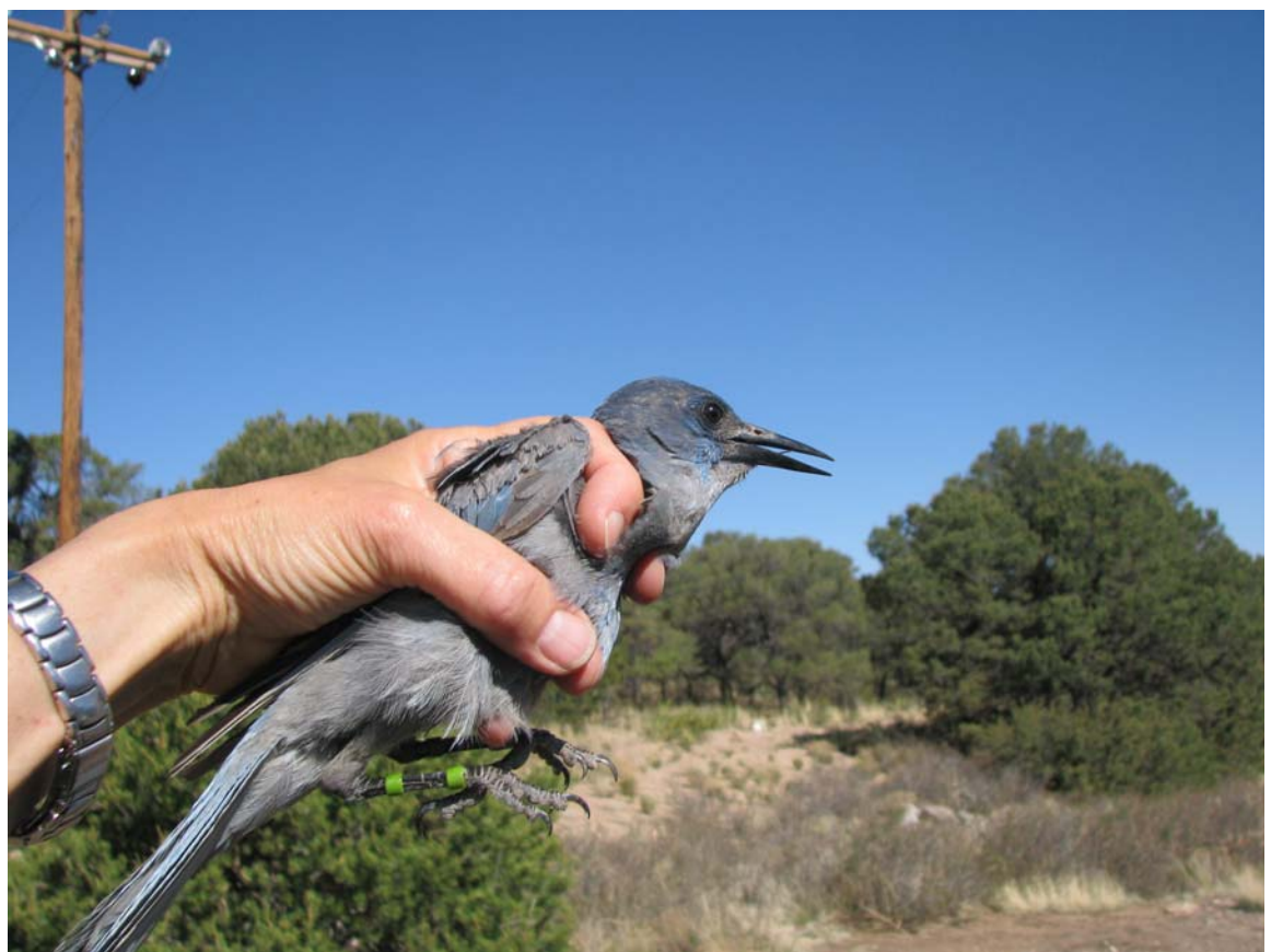
Figure 1. Second-year bird, banded and ready for release.

We visited the study site on 17 March; 7, 17, and 23 April; 5, 19, and 29 May; 9, 10, 11, 17, 18, and 25 June; and 24 and 25 July; noting flock size and location. We stopped visiting the study site for the winter after we were unable to find jays at NOP on the three days in late July when we collected tree data.