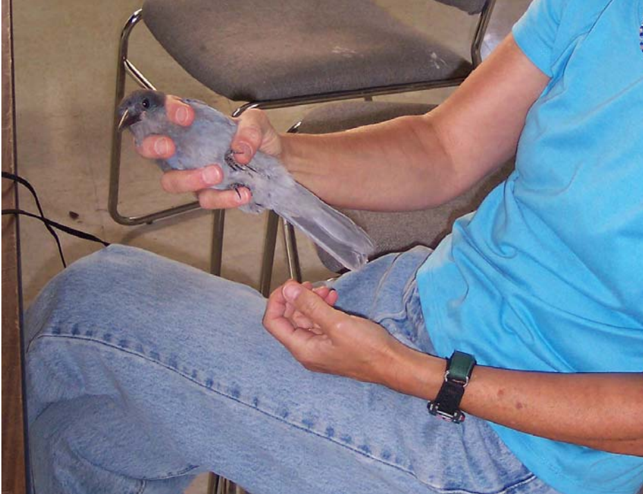
Figure 3. Pinyon jay in hand, showing antenna from radio transmitter.

We visited the study site at least weekly until 13 July, noting flock size and location. We visited the site again in August to look for the flock and on four days in September to collect tree data. We stopped visiting the study site for the winter after we were unable to find jays at NOP on our last two tree data visits,