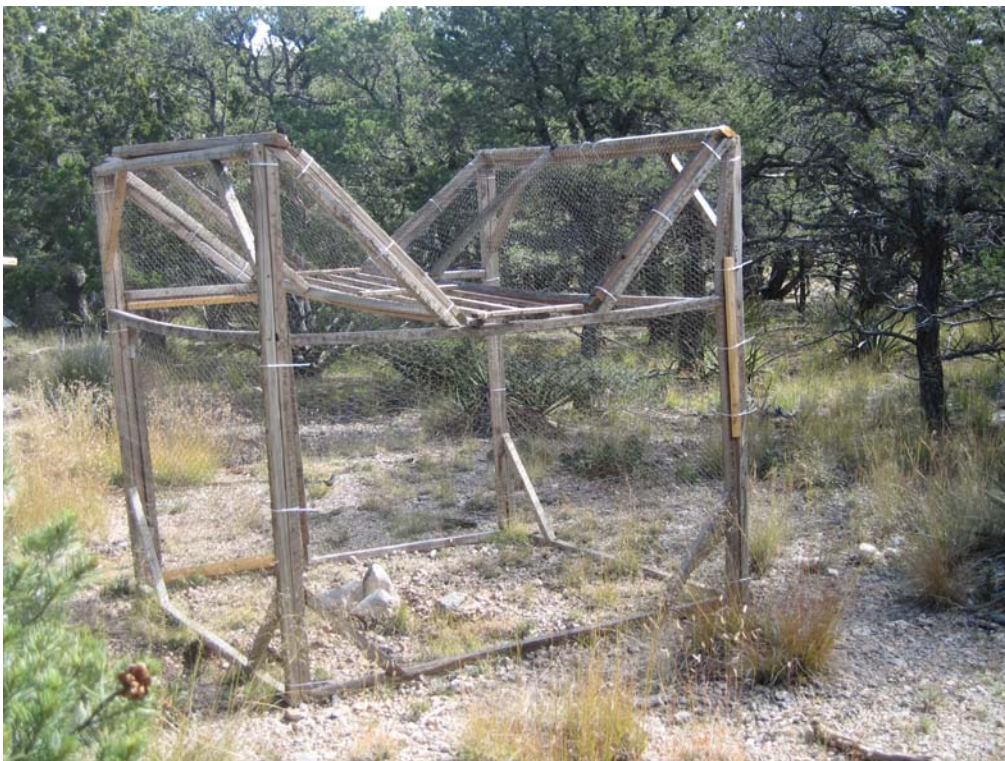
Figure 2. Modified Australian crow trap.