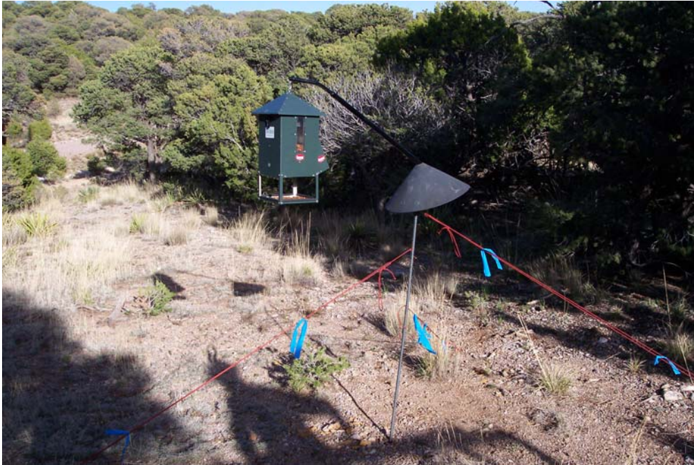
Figure 1. Solar-powered pinyon seed feeder.