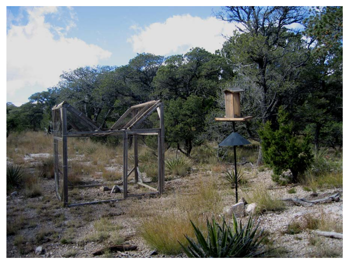
Figure 1. Pinyon feeder and modified Australian crow trap used to capture pinyon jays in 2006.