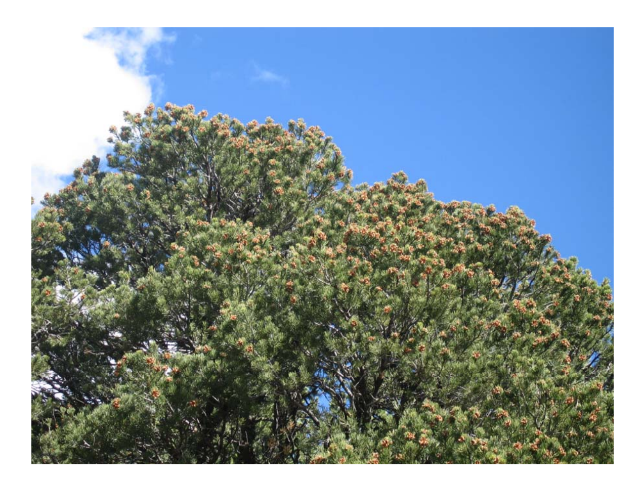
Figure 4. Pinyon tree with abundant ripe cones, NOP study site, 2006.

of points in 2004 (transect 9 was added in 2005) gives 8.26 for an adjusted number of dead trees in 2004. For five of the six transects, vigor in 2006 was apparently related to tree density on the transect - transects with more densely packed trees had lower vigor (Table 2). The exception was transect 7, which was dense but had relatively high vigor. The other two dense transects had the lowest vigor rankings of all six transects.