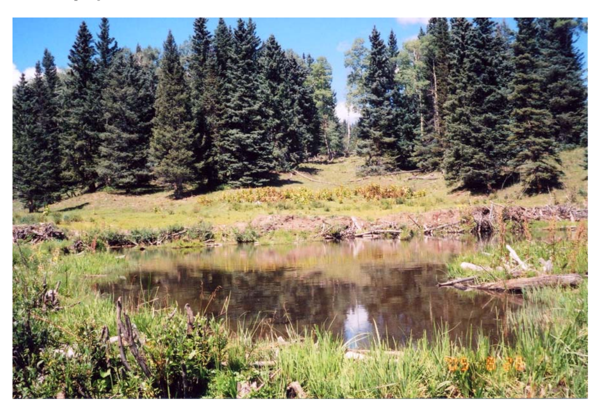
Figure 3. Typical habitat at Lagunitas Lakes in Rio Arriba County, New Mexico.

Nearby forests include Corkbark Fir ( Abies lasiocarpa ), Englemann Spruce ( Picea engelmannii ) and Quaking Aspen ( Populus tremuloides ). These lakes are used for recreation, mostly fishing, and the NMDGF stocks the two main ponds with rainbow trout ( Oncorhynchus mykiss ), at an average of 2030 trout per year since 1998 (NMDGF Fisheries Division). Fathead Minnows ( Pimephales promelas ) are present throughout all lakes (Stuart and Painter 1994). The Boreal Toad was first recorded in New Mexico at these lakes from surveys in 1966 (Campbell and Degenhardt 1971). Jones (1978) estimated 327 toads were present at Lagunitas Lakes in 1978, while Woodward and Mitchell (1985) estimated that only four or fewer female Boreal Toads bred at these lakes in 1985. Woodward and Mitchell (1985) observed ca. 20 tadpoles in 1984, and ca. 2000 in 1985. Carey (1987) found ca. ten toads at the lakes in August of 1985, and numerous one-year old toads in 1986. In a letter to the NMDGF, Carey reported being unable to find toads at Lagunitas Lakes in 1987 (Degenhardt et al. 1996). In 1993, no Boreal Toad adult or tadpoles were found (Stuart and Painter 1994). Nor were any adults or tadpoles found during surveys in 2000-2002 (E. Nelson, US Forest Service, personal communication).