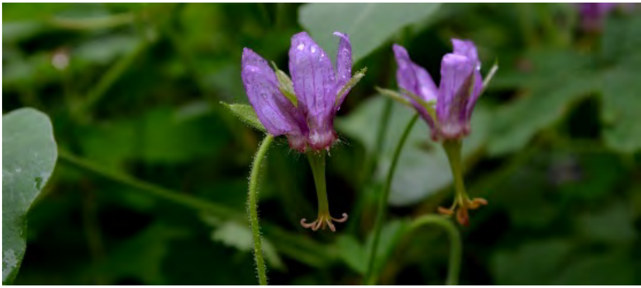
Shootingstar geranium (Geranium dodecatheoides)