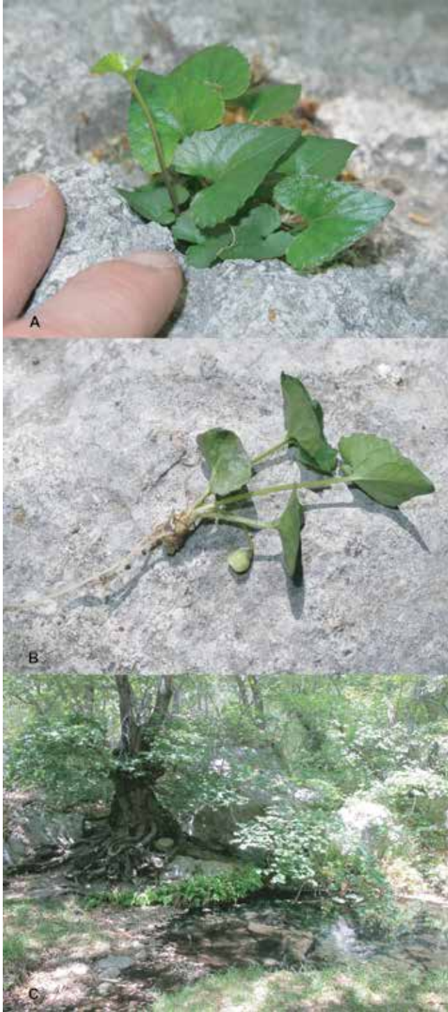
FIG. 3. Viola calcicola sp. nov. A. Photo of typical plant at type locality. B. Plant showing short erect rhizome and the subglobose capsule. C. Type locality, Smith Springs, Guadalupe Mts., May 2011.