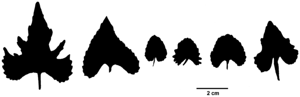
FIG. 2. Variation in leaf blade morphology in Viola calcicola sp. nov.